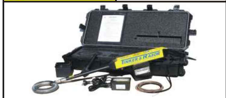
MODEL APS HOLIDAY DETECTOR

DELIVERY: Immediately from STOCK F.O.B. San Gabriel, CA USA