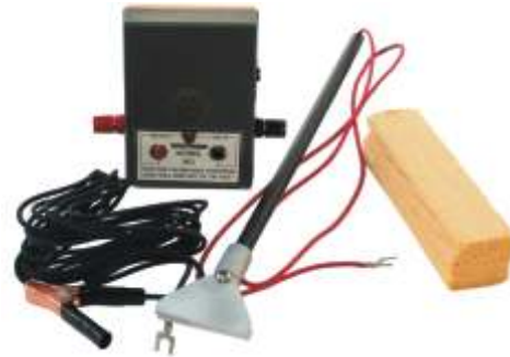
Model M/1 Low Voltage Holiday Detector Kit DC (battery powered) Portable Instrument

DELIVERY: Immediately from STOCK F.O.B. San Gabriel, CA USA SERVICE: 24-hour Turn-Around TERMS: Net30 Days, on approval of credit WARRANTY: 90 Days , parts and labor